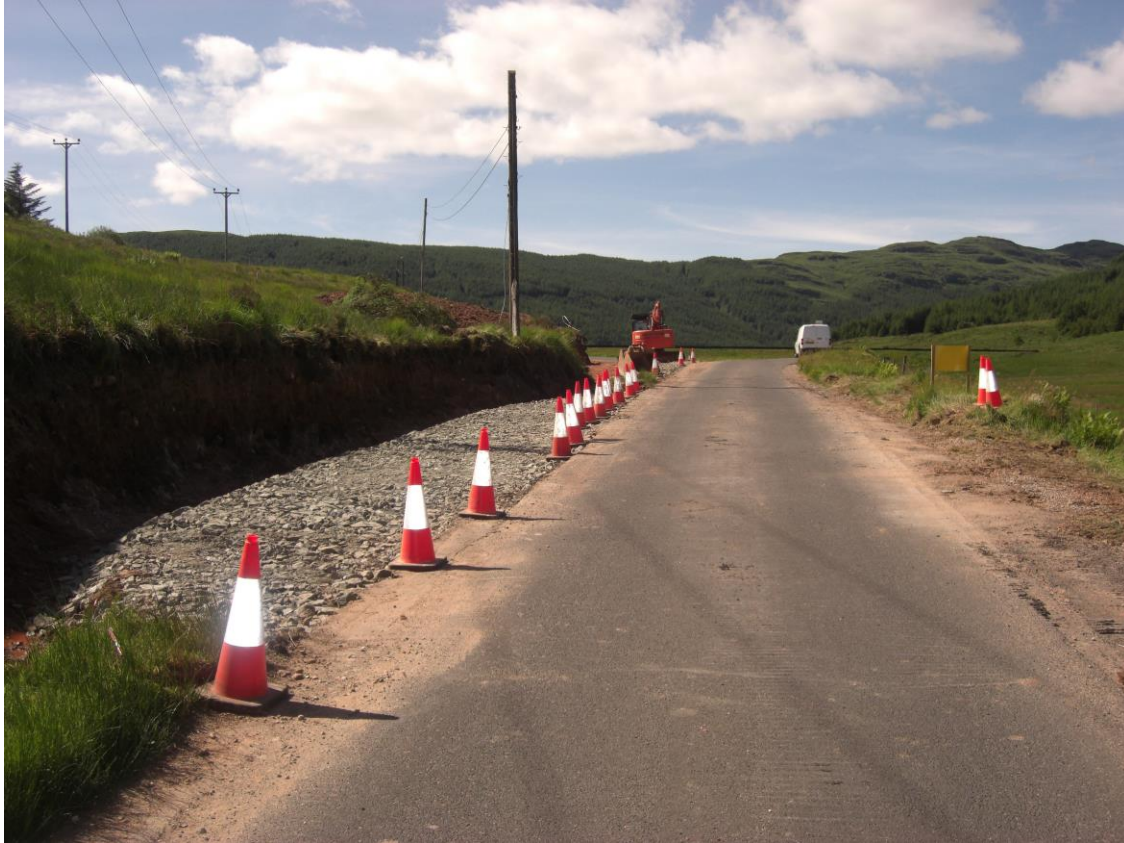
Clachaig – Flats ( looking East) completed passing place and final surfacing 1 st July