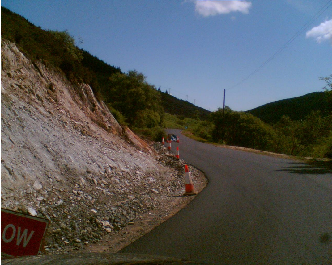
Glen Lean Flats – Balliemore - Ardtarig area , earthworks and widening 1 st July